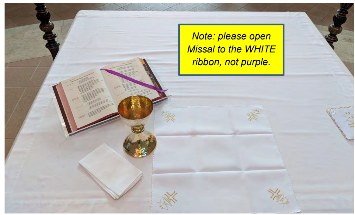
Figure 2 - Setting the Corporal and Chalice

d. Step back and stand at the left edge of the rug and wait for the Priest.